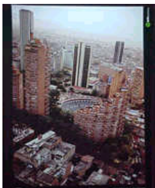
Torres del Parque (Bogotá)

Population: 10.000.000 habitants approximatively Geography: Bogota is located in the centre of the Republic of Colombia, at 2,600 meters above the sea, 4° 35'56" north latitude and 74°04'51" west latitude. Bogota was established on 6 August of 1,538 by Gonzalo Jiménez de Quesada and recognised as Capital District in 1991's Constitution. Bogota is the first economic, cultural, political and social city of Colombia.