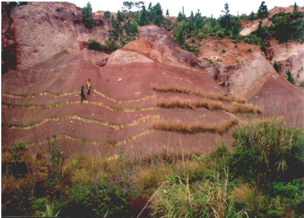
Vetiver grass planted to protect soil erosion. (New Zealand funded ongoing small project)

The fishing ground for the local community especially on the reef has been damage and is expending further. As a result of the damage of the fishing ground the fishermen have to go a long way or out to deeper water to fish.