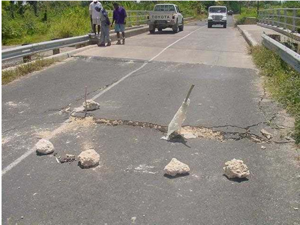
Road infrastructure damage during earthquake in the year 2002.