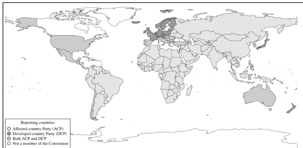
Figure 1 Overview of the national reports submitted in the 2014–2015 reporting and review exercise